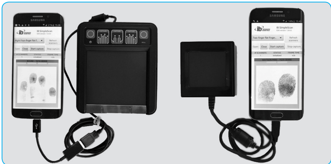
Image files transfer to host PCs, tablets or smartphones using an ordinary USB interface. This connection also acts as the sensor's power source, removing the need for a separate wired connection or battery pack. LES scanners can operate for hours using a cell phone battery without additional auxiliary power, making this technology ideal for field operations using smartphones and tablets.

Since LES sensors rely upon conductivity from the bezel across the finger to the platen to generate an image, LES scanners automatically position fingers for optimal scanning and maximum surface area. Any attempt at spoofing using non-conductive materials is automatically rejected, since no image can result.